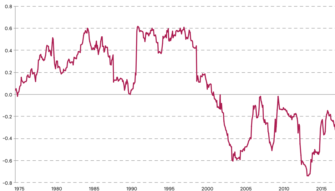
Figure 1: Rolling Three-Year Correlation of US Equities and Bonds

In particular, the diversification benefit provided by the negative correlation between equities and bonds over the past decade or so may not persist. A potential catalyst for such a change could be a shift toward a more inflationary environment in which tighter monetary policy and rising bond yields undermine the returns of both equities and bonds. Although higher levels of inflation are far from inevitable, we believe that the shift in policy discussions toward fiscal stimulus (evident in Canada, Japan, the US and, to a lesser extent, in the UK and Europe) at a time of synchronized global growth raises the likelihood of inflationary pressures emerging over the medium term.